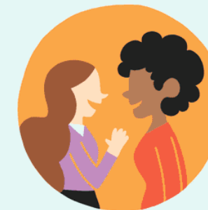
A sense of humor